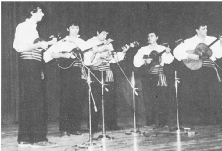
Egyptian string quintet

744 delegates 34 nations a cultureforce of 600 from 6 Univs and headed by Dy Dean in independent charge Sydney Rebeiro 28,000 youth as participants and as audience 1.6 million youth tele-viewers of national hook-up telecasts 1.4 million culture hours over 5 days at 14 hours a day