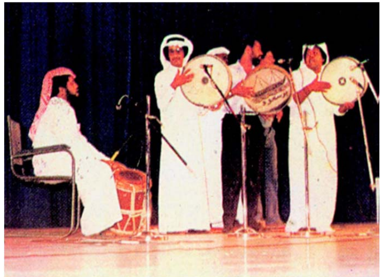
Arabian percussion quartet

744 delegates 34 nations a cultureforce of 600 from 6 Univs and headed by Dy Dean in independent charge Sydney Rebeiro 28,000 youth as participants and as audience 1.6 million youth tele-viewers of national hook-up telecasts 1.4 million culture hours over 5 days at 14 hours a day