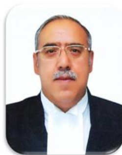
The Hon'ble Justice Deepak Gupta LLB 1978 1st Chief Justice High Court of Tripura 2013