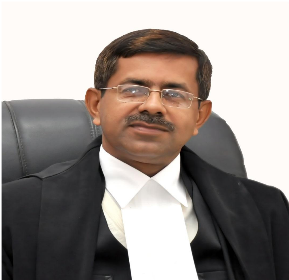
The Hon'ble Justice