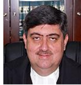
The Hon'ble Justice Sanjay K Kaul BA Eco Hons 1979 St Stephen's LLB 1982 Chief Justice High Court Punjab and Haryana 2013 Chief Justice High Court of Madras 2014