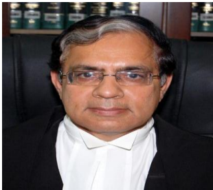
The Hon'ble Justice Arjan K Sikri BCom Hons 1974 SRCC LLB 1977 LLM 1980 Chief Justice Punjab and Haryana High Court 2012 Double Goldmedallist