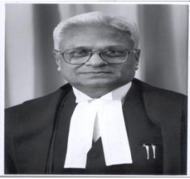
The late Justice Arun Kumar BComHons1960 SRCC LLB 1963 LLM 1965