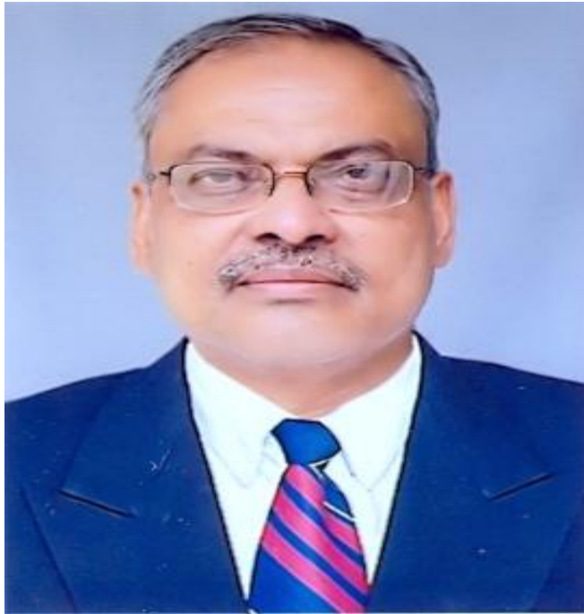
The Hon'ble Justice