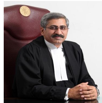
The Hon'ble Justice Dr Sanjeev Sachdeva BCom Hons 1985 SRCC LLB 1988 High Court of Delhi