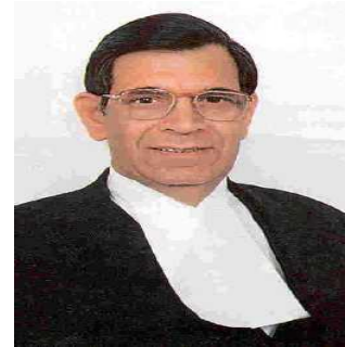
The Hon'ble Justice Y K Sabharwal