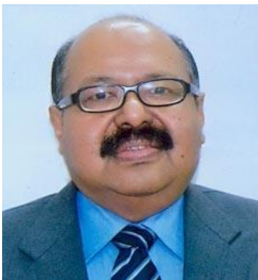
The Hon'ble Justice Hrishikesh Roy LLB 1982 High Court of Gauhati