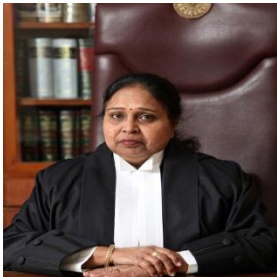
The Hon'ble Justice Sunita Gupta BA Philo Hons 1973 MA 1975 MH LLB 1978 High Court of Delhi