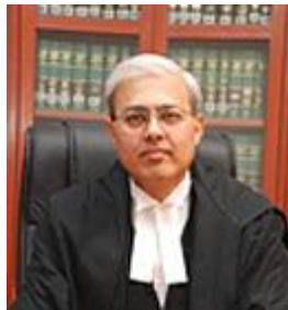
The Hon'ble Justice Manmohan BA Hons Hindu LLB 1987 High Court of Delhi