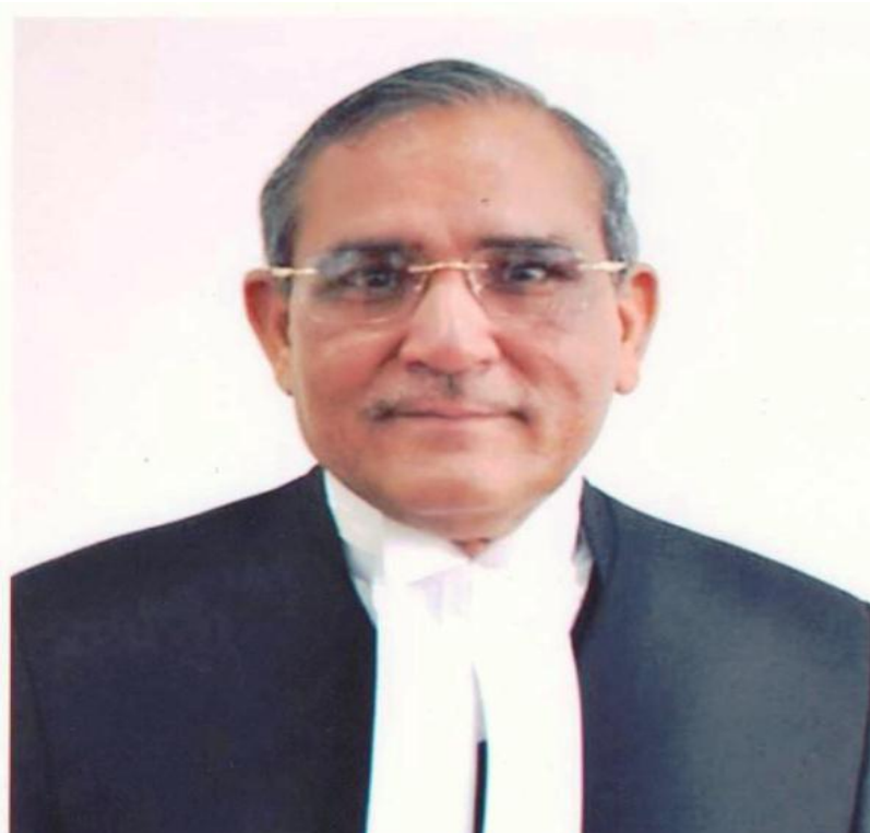
The Hon'ble Justice Narendra Kumar Jain LLB 1977 Chief Justice High Court of Sikkim