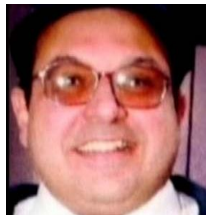
The Hon'ble Justice Rohinton Nariman BCom Hons SRCC LL B CLC Solicitor General of India 2011 - 2013 Judge Supreme Court of India 2014