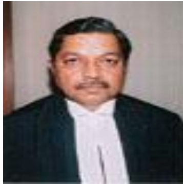
The Hon'ble Justice Kayem Raghuvendra Singh Rathore BA Hons 1974 KM Judge High Court of Rajasthan Jaipur 2007 KM College alumni are popularly defined as Kayems