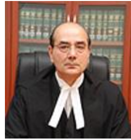
The Hon'ble Justice Sudershan Kumar Misra BA Hindu LLB 1978 High Court of Delhi