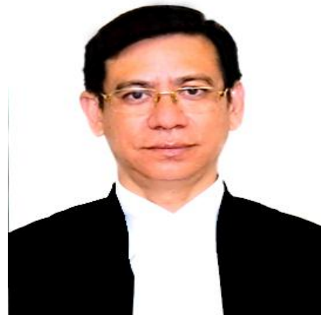
The Hon'ble Justice Kayem N Kotiswar Singh BA Hons Pol Sc 1983 KM LLB 1986 Judge High Court of Manipur