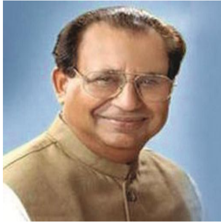
Dr Jagdish Mukhi

Dr Jagdish Mukhi has been appointed Lieutenant Governor of Andaman and Nicobar Islands by the President, Mr Pranab Mukherjee.