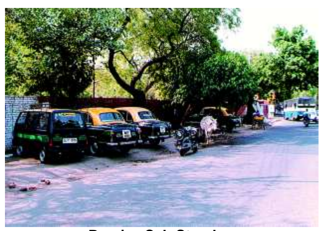
Ramjas Cab Stand Yes, 1956's Ujagar is still here!