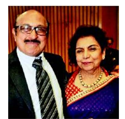
We're very pleased to see our alumni recognizing their Teachers : Eminent Academics, indeed !And thank you, MAMC Alumni !!