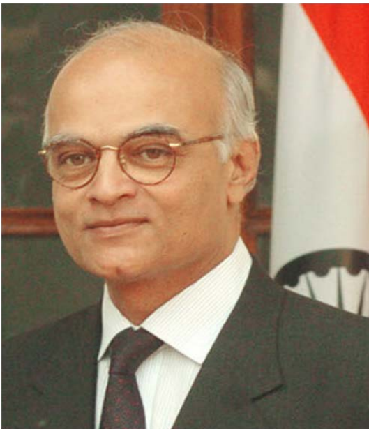
Shivshankar Menon IFS Retd

Environment Pollution ( Prevention and Control ) Authority since 2009