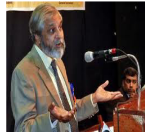
The Hon'ble Justice Madan B Lokur BA His Hons 1974 St Stephen's LLB 1977