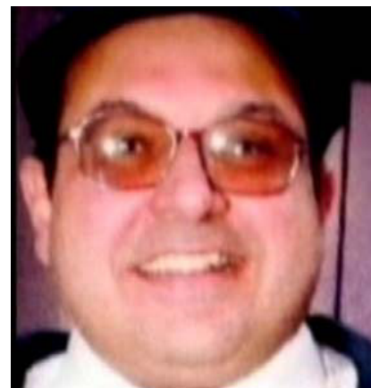
The Hon'ble Justice Rohinton Nariman BCom Hons SRCC LL B CLC Judge Supreme Court of India 2014 Solicitor General of India 2011 - 2013