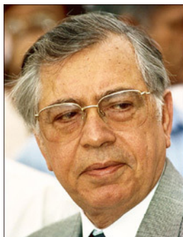
The Hon'ble Justice