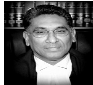
The Hon'ble Justice Vikramajit Sen BA His Hons 1972 St Stephen's LLB 1975 Chief Justice Karnataka High Court 2011