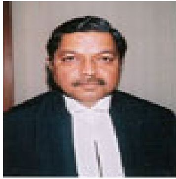
The Hon'ble Justice Kayem Raghuvendra Singh Rathore BA Hons 1974 KM Judge High Court of Rajasthan Jaipur 2007 KM College alumni are popularly defined as Kayems