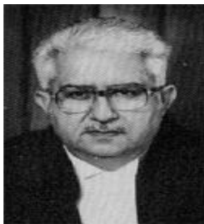
The Hon'ble Justice