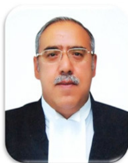
The Hon'ble Justice Deepak Gupta LLB 1978 1st Chief Justice High Court of Tripura 2013