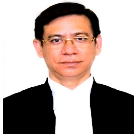
The Hon'ble Justice Kayem N Kotiswar Singh BA Hons Pol Sc 1983 KM LLB 1986 Judge High Court of Manipur