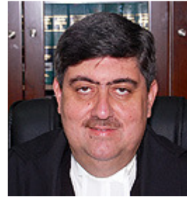
The Hon'ble Justice Sanjay K Kaul BA Eco Hons 1979 St Stephen's LLB 1982 Chief Justice High Court Punjab and Haryana 2013 Chief Justice High Court of Madras 2014