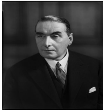
Sir Maurice Gwyer