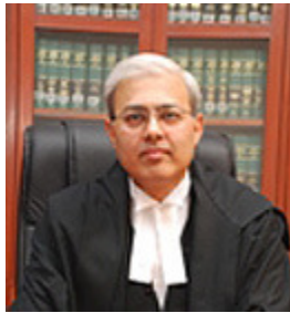
The Hon'ble Justice Manmohan BA Hons His 1984 Hindu LLB 1987 High Court of Delhi