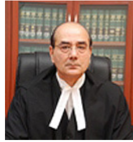
The Hon'ble Justice Sudershan Kumar Misra BA Hindu LLB 1978 High Court of Delhi