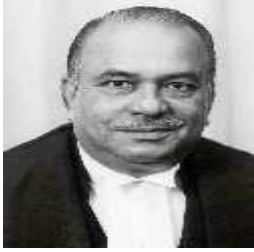
The Hon'ble Justice B P Singh BA Pol Sci Hons 1961 Hindu LLB 1963 The Supreme Court of India 2001 - 2003